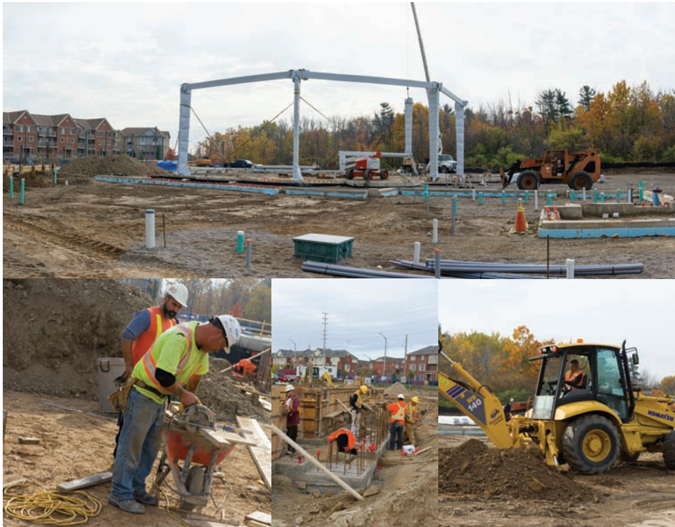
We are excited to see the church really taking shape from the ground up. Let us continue to pray for the success of the project and for the safety of the construction workers.